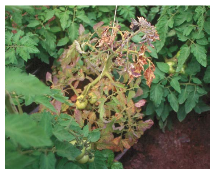
Figure 1. Tomato infected with TSWV.

Symptoms - Symptoms of TSWV are numerous and varied. However, there are two fairly common symptoms for which this disease was named. First, the young leaves turn bronze and subsequently develop numerous small, dark spots. Second, the leaves often droop on the plant, creating a wilt-like appearance, although the plant is not actually wilted (Figs. 1 and 2).