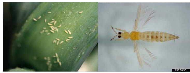
Figure 8. Onion thrips (left) and western flower thrips (right), two important vectors of TSWV in NM (Left photo: Whitney Cranshaw, Colorado State University; Right photo: Jack T. Reed, Mississippi State University).

Virus Transmission - TSWV is transmitted from infected plants to healthy plants by at least ten species of thrips. Thrips are tiny (approximately 1/16th of an inch) winged insects that feed on plants through sucking mouthparts (Fig. 8). Thrips transmit the virus in a persistent propagative manner, which means that once the insect has picked up the virus, the virus replicates within the insect and it is able to transmit the virus for the remainder of its life. The virus is not passed on from adult to egg; however, progeny that develop on infected plants will quickly pick up the virus and be an effective disease vector.