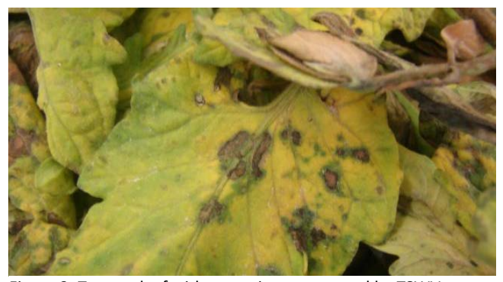
Figure 2. Tomato leaf with necrotic spots caused by TSWV

Other symptoms include die-back of the growing tips (Fig. 3), stunting, mottling (Fig. 4) and dark streaking on the stems (Fig 5). Leaves may also develop dark green spots surrounded by yellow tissue or concentric ringspots (Fig. 6). Affected plants may develop a one-sided growth habit or may be stunted completely. Plants that are affected early in the growing season often do not produce any fruit, while those infected after fruit-set produce fruit with striking symptoms, including chlorotic concentric ringspots, raised bumps, uneven ripening, and deformity (Fig 7). Infected plants produce poor quality fruit and have reduced yield. In some cases, particularly with peppers, foliage symptoms may be very subtle or nonexistent, but fruit symptoms may be very pronounced.