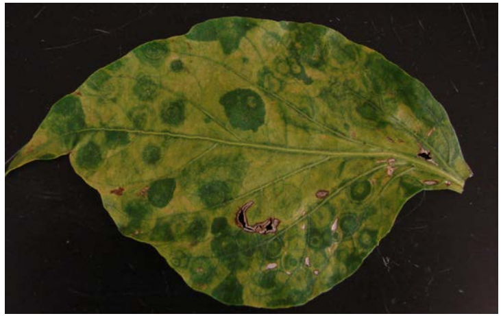
Figure 4. Mottling caused by TSWV.