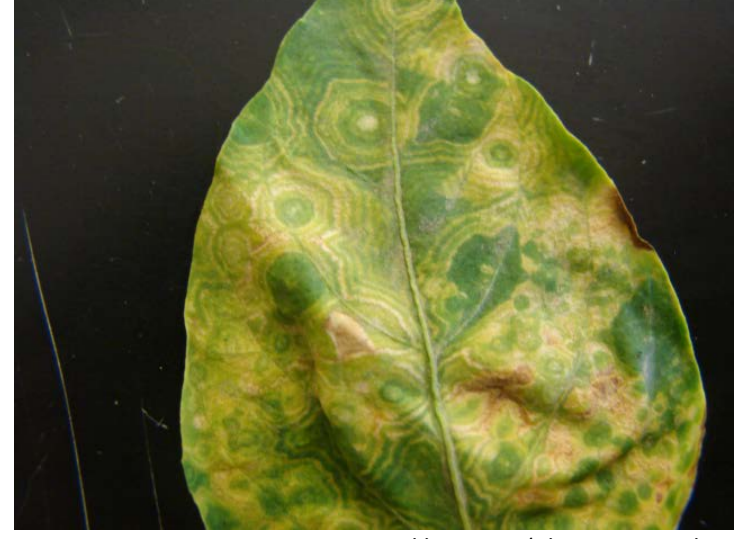
Figure 6. Concentric ringspots caused by TSWV.