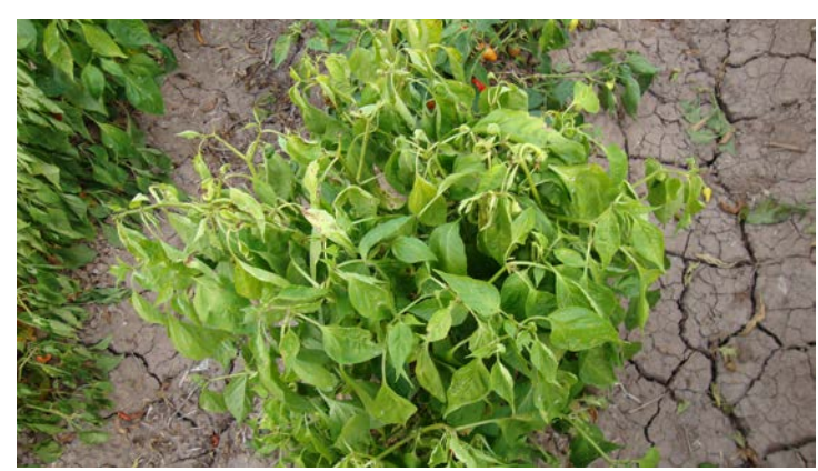
Figure 3. Terminal necrosis on chile pepper caused by TSWV.

Other symptoms include die-back of the growing tips (Fig. 3), stunting, mottling (Fig. 4) and dark streaking on the stems (Fig 5). Leaves may also develop dark green spots surrounded by yellow tissue or concentric ringspots (Fig. 6). Affected plants may develop a one-sided growth habit or may be stunted completely. Plants that are affected early in the growing season often do not produce any fruit, while those infected after fruit-set produce fruit with striking symptoms, including chlorotic concentric ringspots, raised bumps, uneven ripening, and deformity (Fig 7). Infected plants produce poor quality fruit and have reduced yield. In some cases, particularly with peppers, foliage symptoms may be very subtle or nonexistent, but fruit symptoms may be very pronounced.