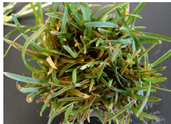
Leaf rust on Kentucky bluegrass.

Cool to warm (60-86°F), moist weather favors rust infections. Leaf wetness is required for infection. Condensed moisture, even dew, for 10 to 12 hours is sufficient for spores to infect plants. After infection, slightly warmer and drier conditions favor disease development and symptom expression. Rusts are often more severe in shaded areas than sunlit areas. Grass which is growing slowly under stressed conditions (nitrogen deficiency, low mowing height, compaction, drought and high temperature) is more susceptible to disease.