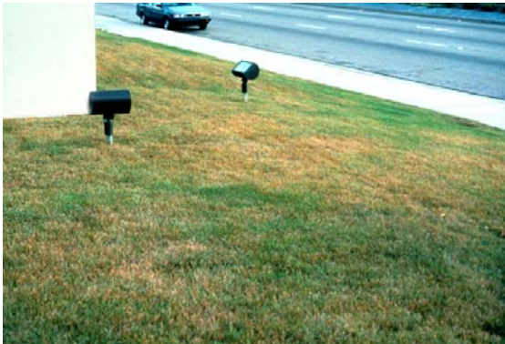
Stem rust on a Kentucky bluegrass lawn.

Management: Cultural practices which help to reduce the occurrence and severity of the disease include: