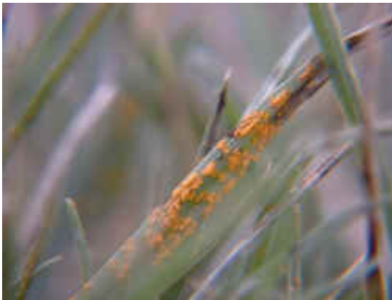
Rust on perennial ryegrass.