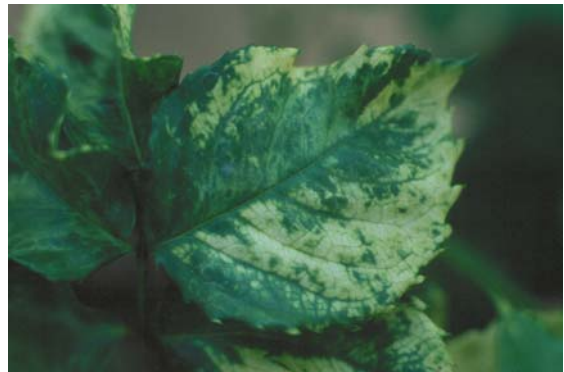
Mosaic symptoms caused by rose mosaic.