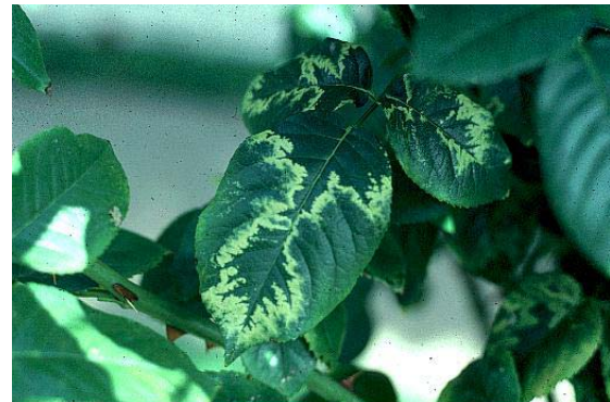
Chlorotic bands in an oak-leaf pattern caused by rose mosaic.

means and there is no evidence that rose mosaic spreads from plant to plant in a garden setting. Because the disease often occurs on only one cane or a few leaves, it is mistakenly thought to be relatively harmless. However infected plants have decreased vigor, produce fewer flowers on shorter stems, have poorer transplant survival rates, and are more susceptible to winter-kill.