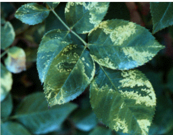
Symptoms caused by rose mosaic.

Management: Once the plant is infected, there is no cure. Infected portions of the plant can be pruned, however this simply removes the symptoms; the plant is systemically infected and will eventually develop symptoms on other leaves and canes. Infected plants should be removed and destroyed if they are not performing up to desired levels, but they are not a risk for spreading the disease to healthy plants. When purchasing new roses, buy only certified virus free plants.