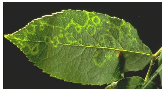
Chlorotic ringspots caused by rose mosaic.