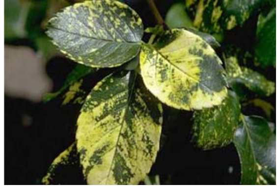
Mosaic symptoms caused by rose mosaic.