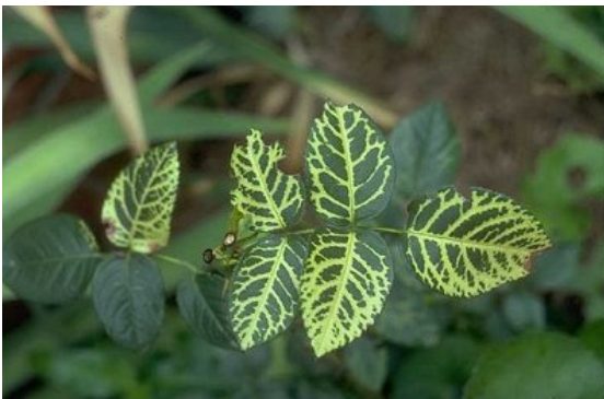
Yellow vein banding caused by rose mosaic.