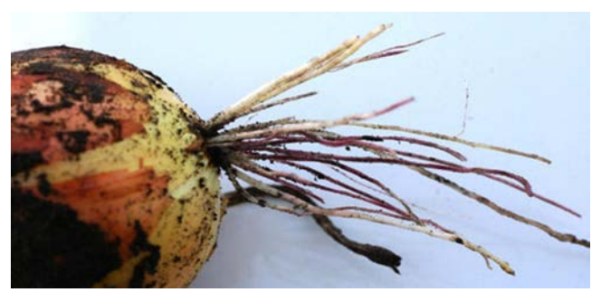
Figure 3. Late symptoms of pink root on onion.