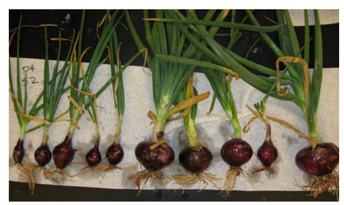
Figure 4. Bulb size is reduced in severely infected plants.