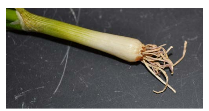
Figure 2. Early symptoms of pink root on onion