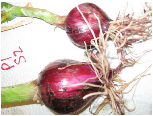
Figure 1. Pink root on onions

Disease Cycle – The pathogen survives in soil, plant debris, and colonized roots as chlamydospores (Figure 5), pycnidia and pycniospores (Figure 6). The fungus survives for long periods in the absence of a host plant. When a susceptible host is available, pycniospores germinate and infect the roots. The fungus moves through the roots, but doesn't infect the basal plate or the scales. The fungus completes its life cycle when it produces the overwintering structures (chlamydospores and pycnidia) in the infected tissue.