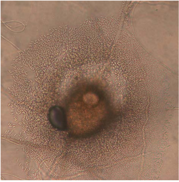
Figure 6. A Pycnidium and pycnidiospores of Phoma terrestris.

Conditions for Disease – The disease is most damaging in heavy, poorly drained soils that are low in organic matter. Plants weakened by other diseases, insects, or abiotic disorders such as temperature stress, excessive water, and nutrient problems are more susceptible to disease. The disease is favored by warm (75 – 82 F), moist soils.