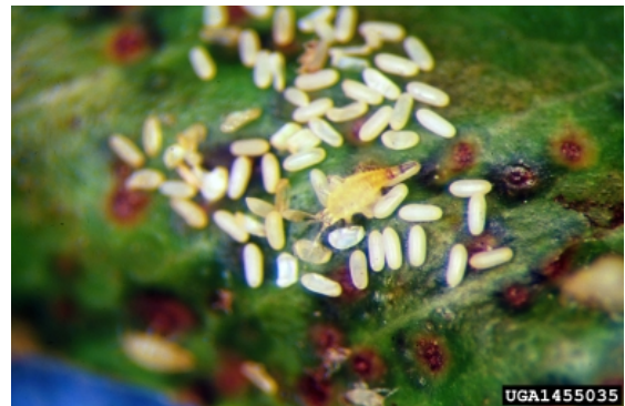
Damage by Cuban laurel thrips, Gynaikothrips ficorum , causes the foliage of several species of Ficus to curl and fold, creating microhabitats for these comparatively large thrips to feed and reproduce. The white eggs are shown here along with a yellow nymph.

New Mexico State University is an equal opportunity/affirmative action employer and educator. NMSU and the U.S. Department of Agriculture cooperating.