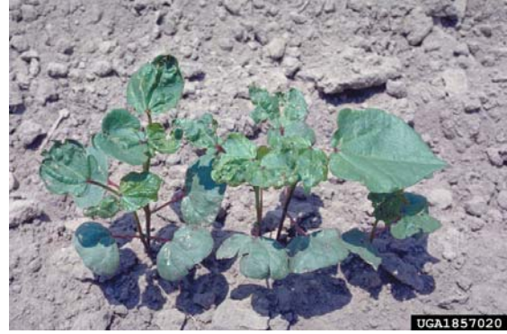
Thrips damage ( Frankliniella sp.) can occur during cool weather on seedling plants like this cotton. Note the puckered, misshaped new growth. When temperatures rise, the thrips are at a disadvantage and the newest foliage will look more normal in size and shape.