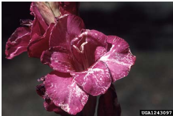
The white marks this gladiolus flower result from feeding by gladiolus thrips, Thrips simplex .