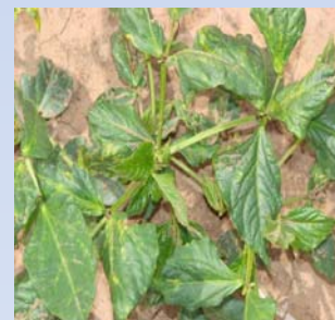
Tomato Spotted Wilt Virus of Cowpea