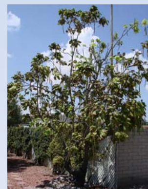
Northern Catalpa infected with Xylella fastidiosa