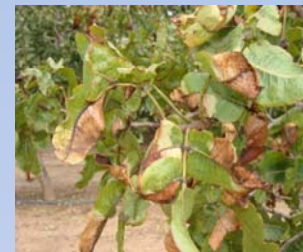
Alternaria late blight foliar symptoms