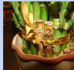
Anthracnose of lucky bamboo Colletotrichum dracaenophilum