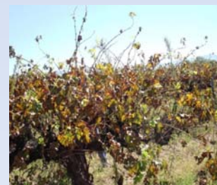
Pierce's disease Xylella fastidiosa of Grape