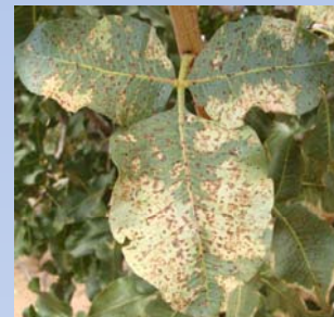
Advanced symptoms of Septoria leaf spot