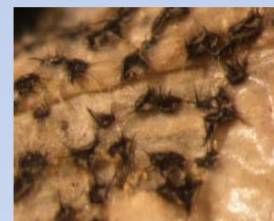
Setae of Colletotrichum dracaenophilum