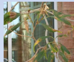
X Chitalpa tashkentensis infected with Xylella fastidiosa