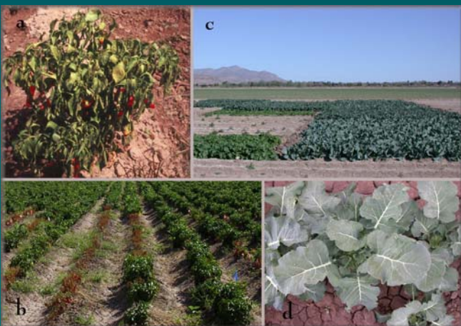
Figure 1: a) chile plant infected with Verticillium dahlia , b) chile plants infected with Phytophthora capsici , c) Brassica crops, d) broccoli plant

Phytophthora root rot is common in heavier soils where water stands for extended periods. Because chile plants infected with this pathogen die very rapidly, it is detected more often than Verticillium wilt. Phytophthora spreads rapidly and can not be controlled after infection has occurred. Management of Phytophthora in chile is dependent solely on cultural practices.