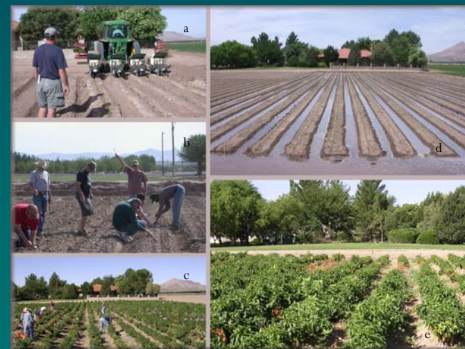
Figure 3: a) chile transplanter, b) transplanting crew, c) chile harvest, d) irrigation following transplanting, e) mature chile plants

Results from both years demonstrated that Brassica crop residues have the potential to reduce wilt caused by Verticillium dahlia and Phytophthora capsici , and therefore increase yield, in pepper crops grown in southern New Mexico. This study is being repeated in 2004.